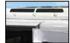
Rooftop Mount AC