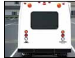
Rear Wall (shown with optional light package)