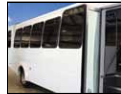
High Gloss Exterior Fiberglass