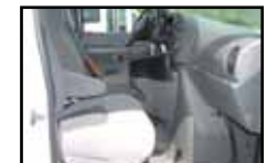
Driver & Co-Pilot