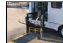
Rear Wheel Chair Lift