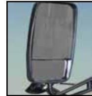
Breakaway Convex Mirror

Due to constant product improvements, specifications, component parts and optional equipment are subject to change without notice or obligation. See your dealer for details. Photos may show optional equipment.